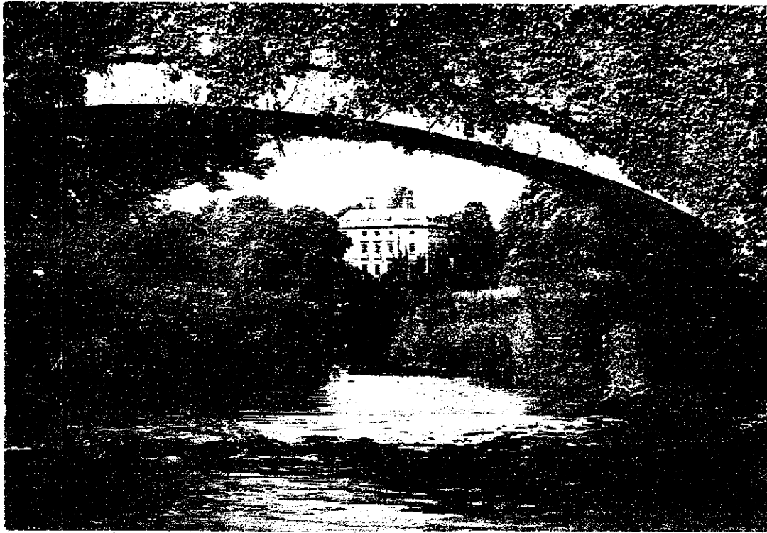
Abbey Leix from the River Nore De Vesci Mansion